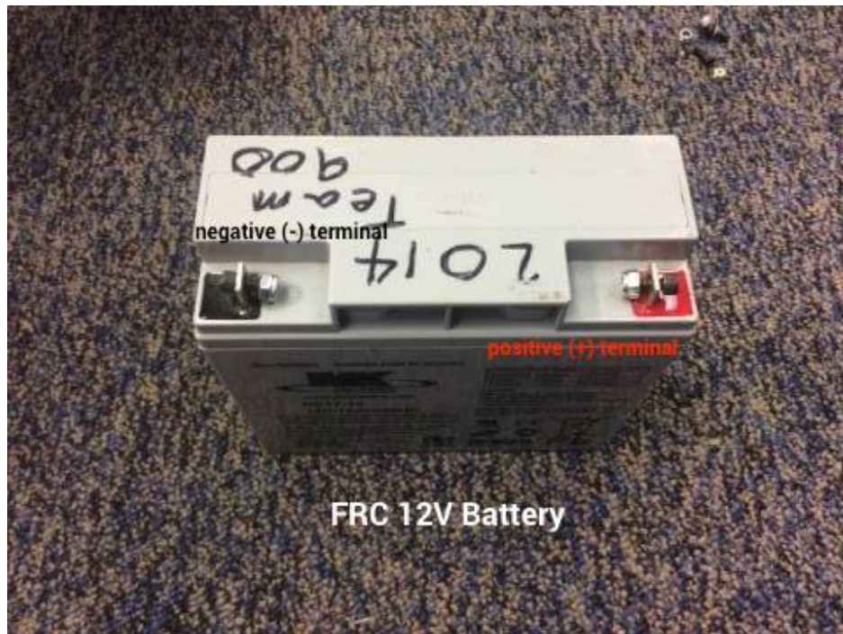
Figure 6.1: Battery without cables. Nut and bolt orientation is shown as they were before upgrade.