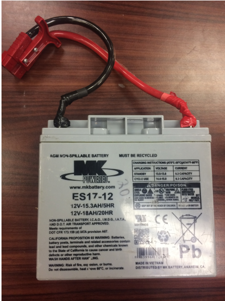
Figure 2.1: Note how the electrical tape peels away, leaving metal exposed.

Like most FRC teams, we have been bitten by loose battery connections from bolts, nuts, and even poor insulation. We've also researched the marginal improvement gains to be had from switching from 6 AWG cables to 4 AWG cables on our batteries. While 6-gauge wire has .3951 Ohm per 1000 ft of resistance, 4-gauge wire has .2485 Ohm per 1000 ft 1 of resistance.