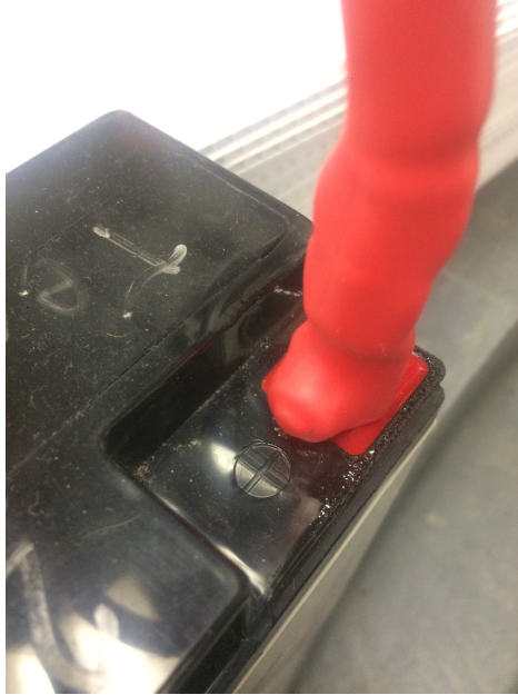
Figure 6.7: This is what happens when the heat gun melts the battery case plastic. Salvador Dali batteries are not desirable.

8. The finished battery should look similar to the one below. [Figure 6.8]