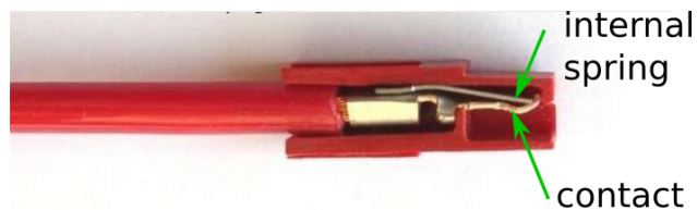
Figure 6.4: The internal workings of an Anderson Powerpole connector