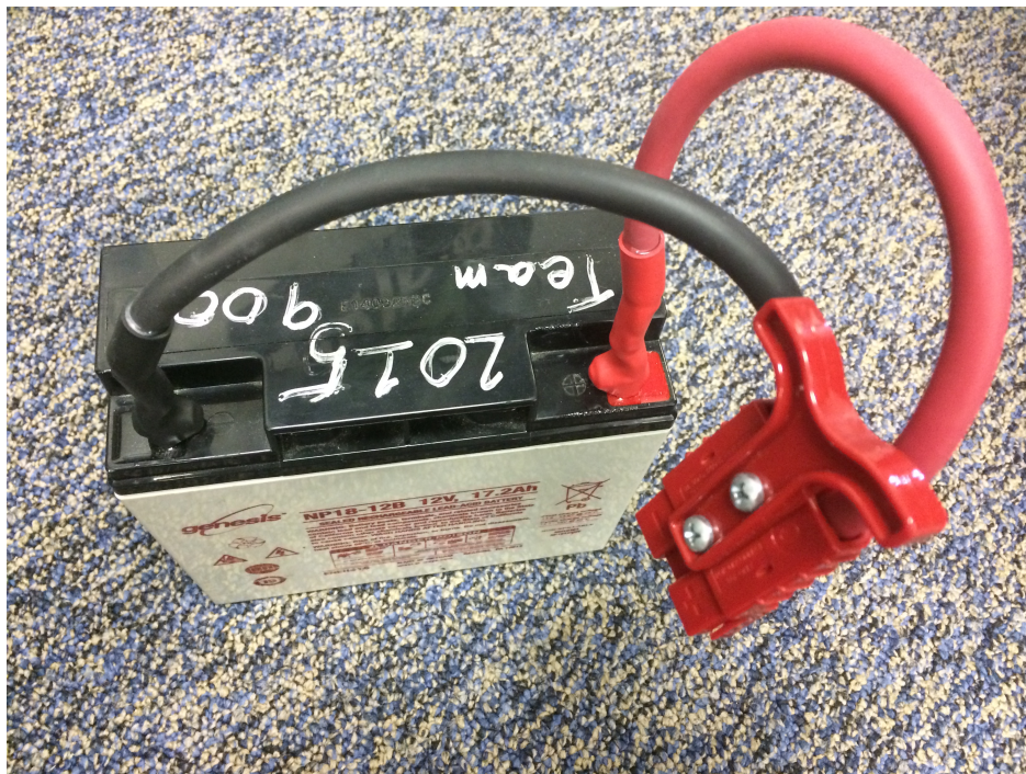
Figure 6.8: A completed battery. Yay!

8. The finished battery should look similar to the one below. [Figure 6.8]