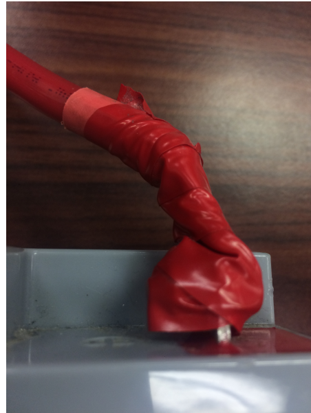
Figure 2.2: The wire underneath contorts over time as well.