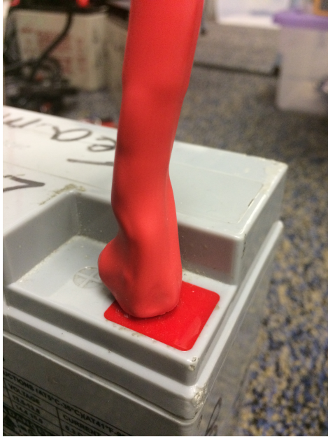
Figure 6.6: A very beautifully done heatshrink battery terminal