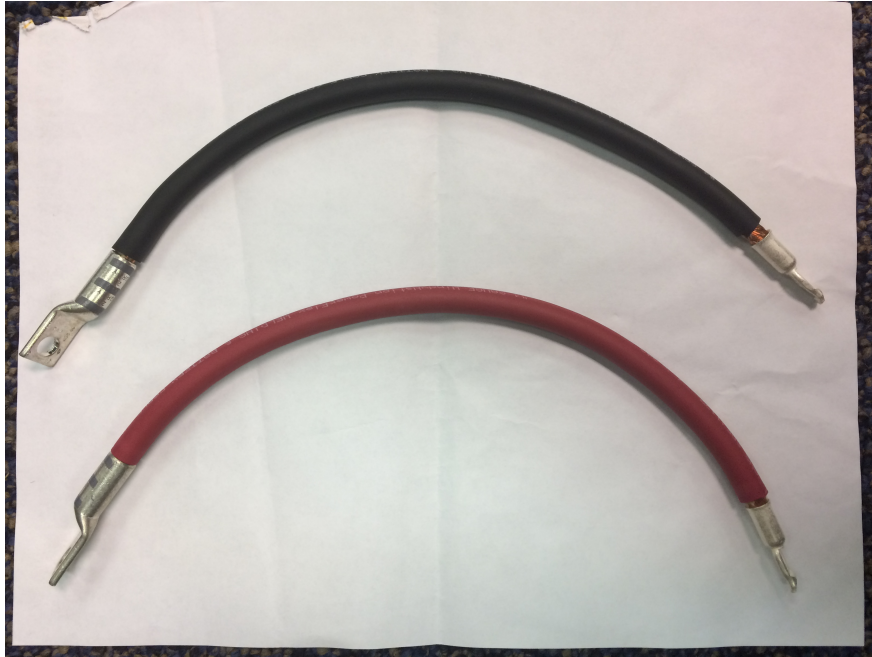
Figure 6.3: 4-gauge cables with lugs on both ends