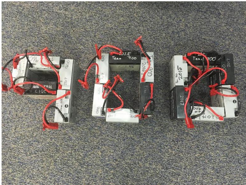
Figure 1.1: Batteries arranged in a conspicuous pattern.

This paper will discuss the process that our team went through to upgrade our battery cables and connectors in an attempt to improve robot performance.